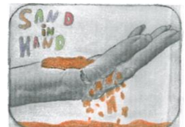
You Don't Have to be a Kid to Play with Sand