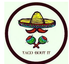
Everyone is Talking about Tacos