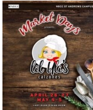
Fresh Calzones & Garlic Fingers w/ Signature Dipping Sauce