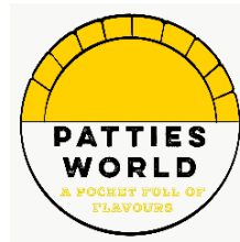
Meat Filled Patties w/a Jamaican Flair