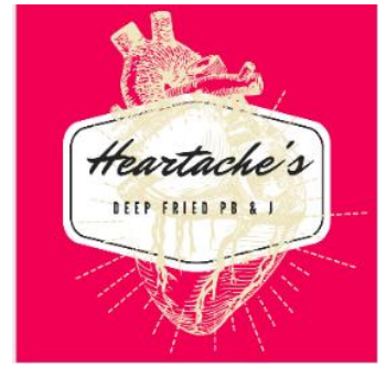
A Nostalgic Twist on P B & J Sandwiches