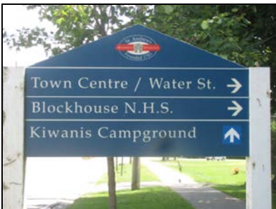
An example of heritage-themed signage, initiated in 2000 and planned for longterm town-wide use

In the early 1970s, the demolition of a prominent downtown heritage building and a fire that destroyed Conley’s Lobster Plant (the town’s remaining commercial fisheries employer and a major tourist attraction) led to a growing awareness that built heritage may be an important but fragile part of the town’s future.