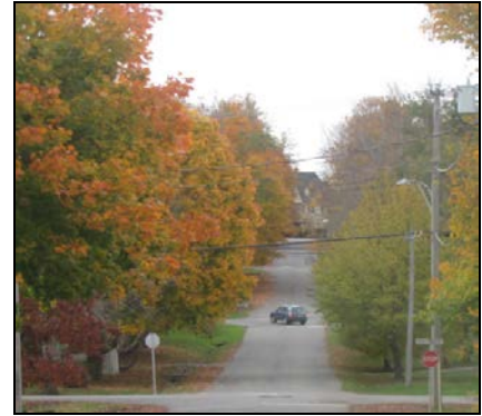
Tree lined streets are an important part of the town’s character and heritage: efforts to maintain these are ongoing.

Heritage development continued by other means.