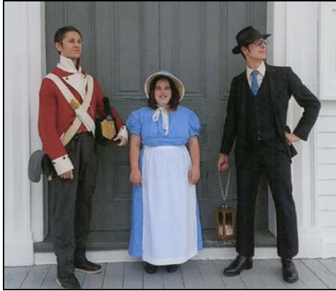
These summer staff at the Charlotte County Archives lead regular walking tours, June-August. Live historical interpretation is also provided seasonally at the Blockhouse, Ross Memorial Museum and Sheriff Andrews House.

In the latter half of the 1980s, the St. Andrews Business Improvement Area (BIA) Association and the Town collaborated on heritage-oriented downtown revitalization projects under a federal-provincial Main Street Program, to formalize the Historic Business District. This work included storefront façade restorations, the current lamp posts and brick-lined sidewalks and today's Market Square.