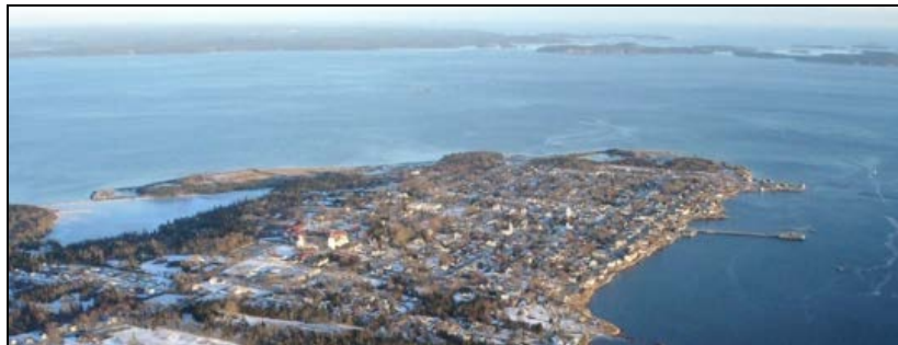
The St. Andrews peninsula today, with the Fundy Isles and Bay of Fundy in the background. A community with over 200 years of permanent settlement and a rich "by-the-sea" heritage.

Across two centuries of permanent settlement and through transitions in the economy and focus, the people of St. Andrews have largely appreciated and maintained much of the town's defining architecture and sense-of-place. As a result, St. Andrews retains one of the most significant collections of Canada's early built heritage and, unique nationwide, has over 300 buildings that are over a century old.