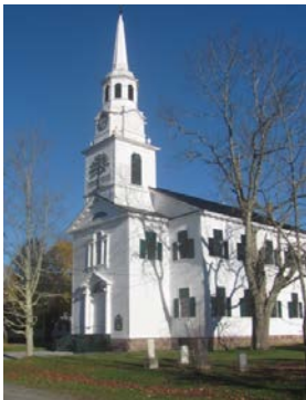
Greenock Presbyterian Church, a National Historic Site.

Heritage certainly involves individual buildings and St. Andrews has an extraordinary wealth of these. Unique nationwide, 326 St. Andrews buildings are already documented as being more than a hundred years old and many others are fast approaching that age. These heritage buildings distinctly identify St. Andrews as a place with a different pace, one where Canada's history can be seen alive, daily, in its homes and businesses. Nevertheless, St. Andrews is an active community and not a museum: here new development continues to blend with the old, largely respecting the past.